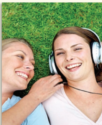
Listening to music